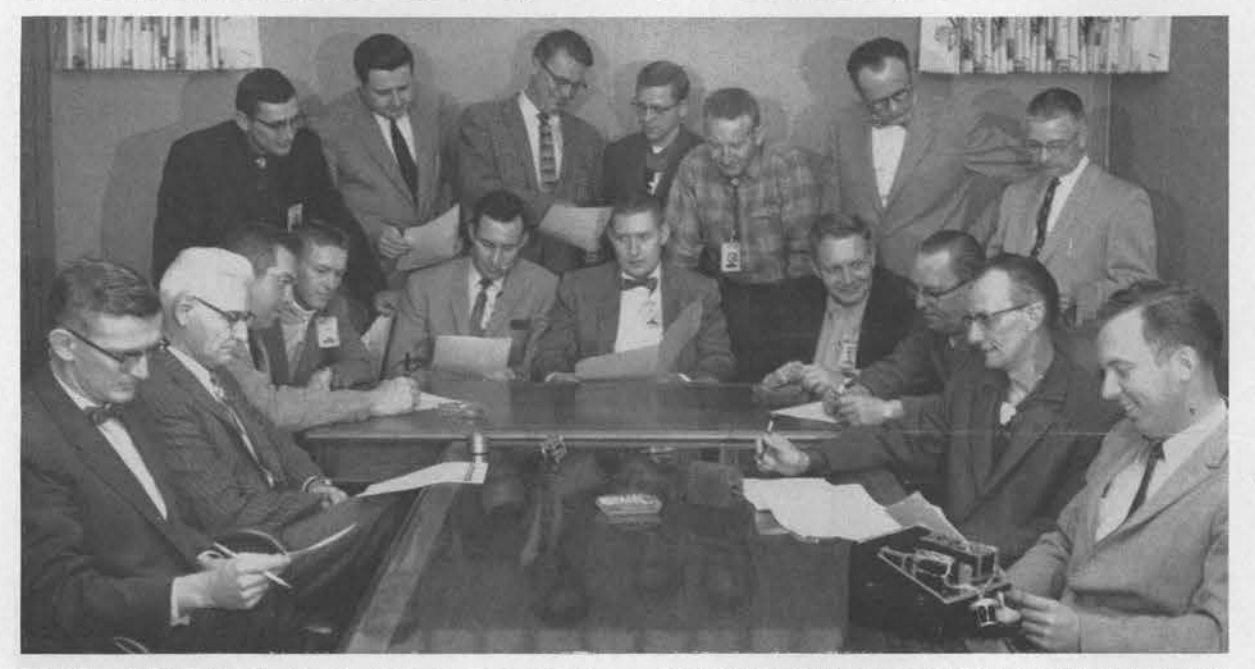
MANY, MANY thousands of dollars were saved taxpayers by this group and other manufacturing engineers of the Manufacturing Development or-